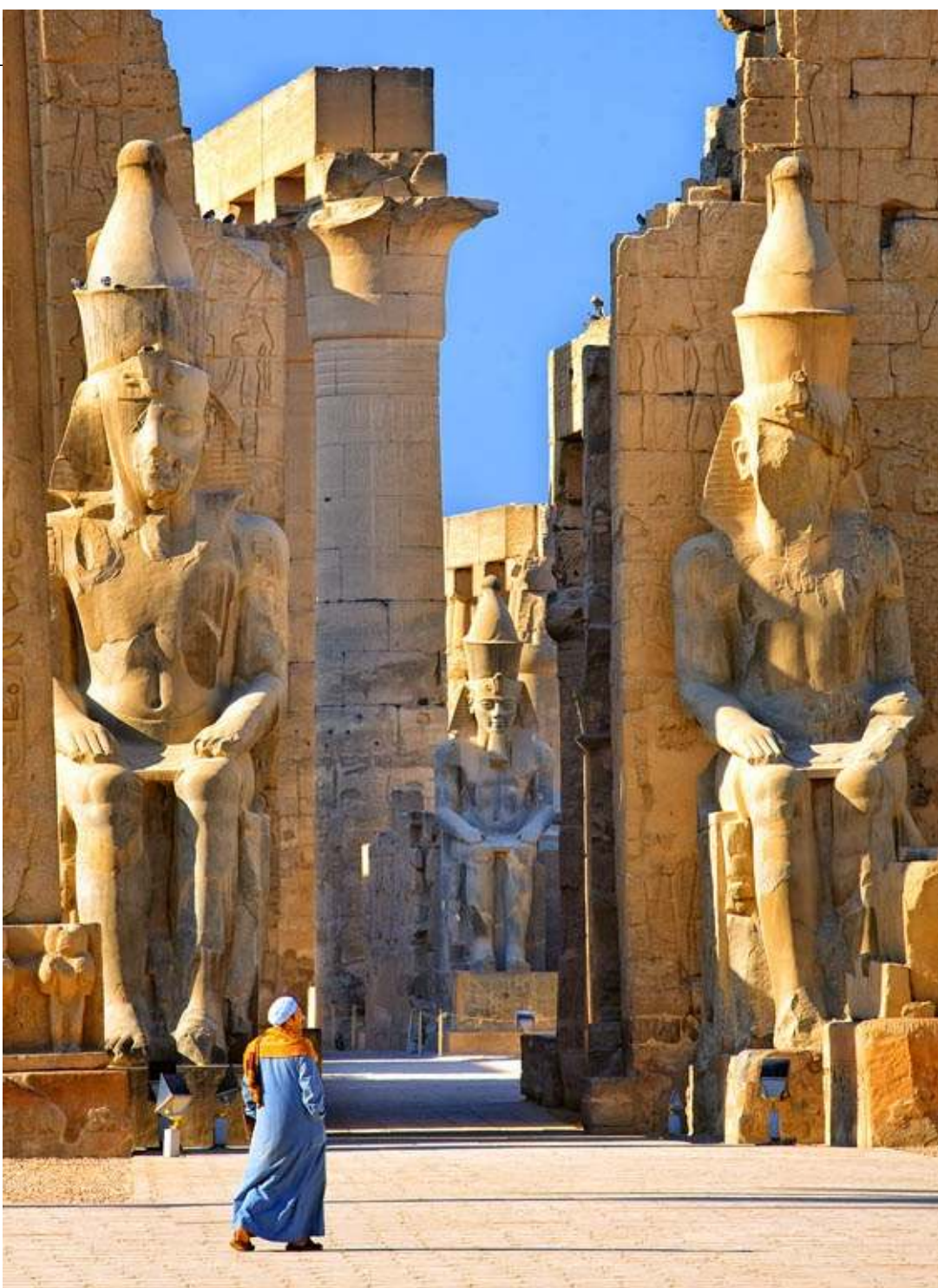
Luxor Temple