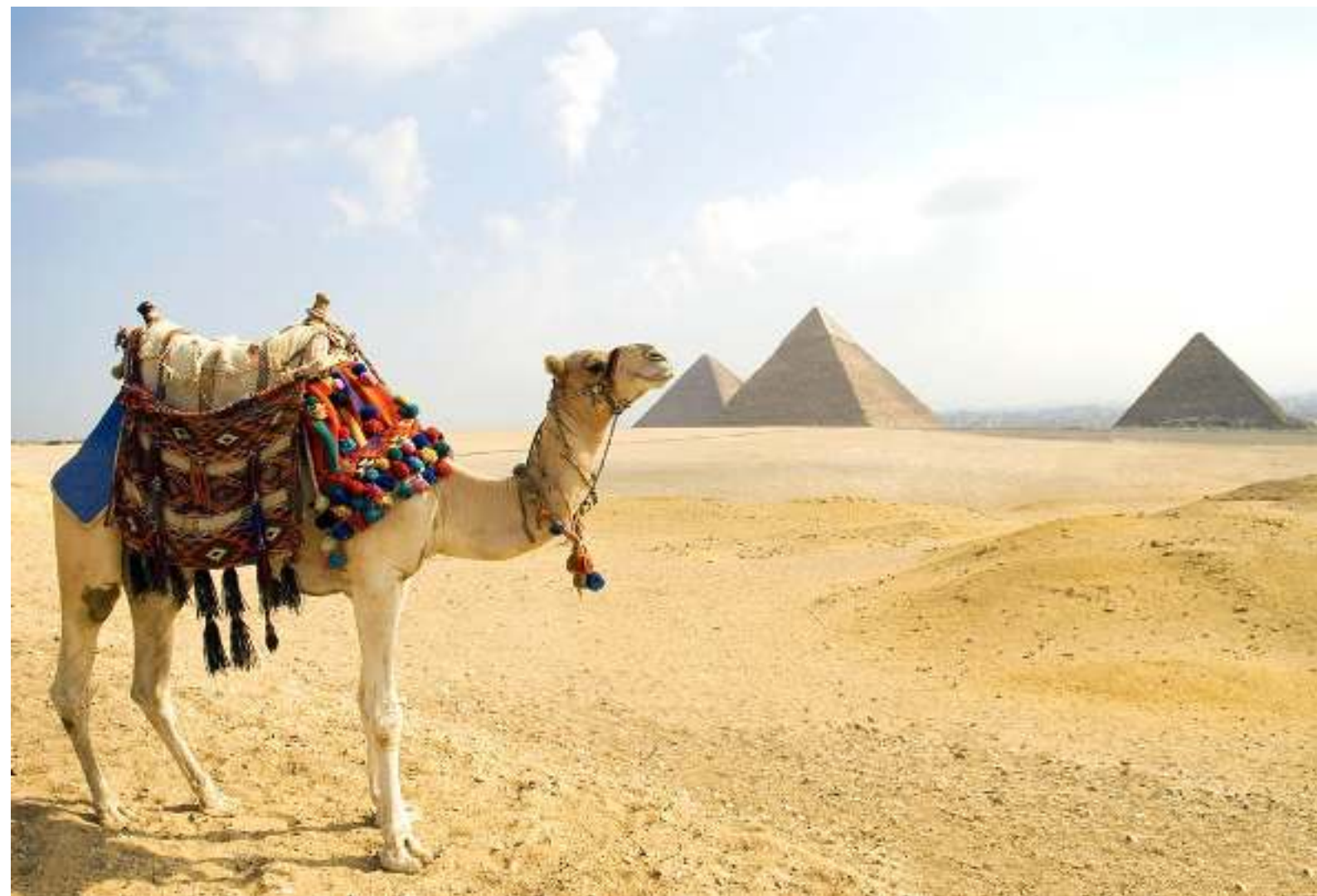
Pyramids of Giza

Towering over the urban sprawl of Cairo and the desert plains beyond, the Pyramids of Giza and the Sphinx are at the top of almost every traveller's itinerary. Bring lots of water, an empty memory card and plenty of patience! You may have to fend off a few eager locals pushing horse rides and Bedouin headdresses in order to enjoy this ancient funerary complex, but no trip to Egypt is complete without a photo of you in front of the last surviving ancient wonder of the world. For the best, and also the most clichéd, pic of all, head for the cliff beyond the third pyramid, with a panoramic view of the three pyramids with all of Cairo as a background.