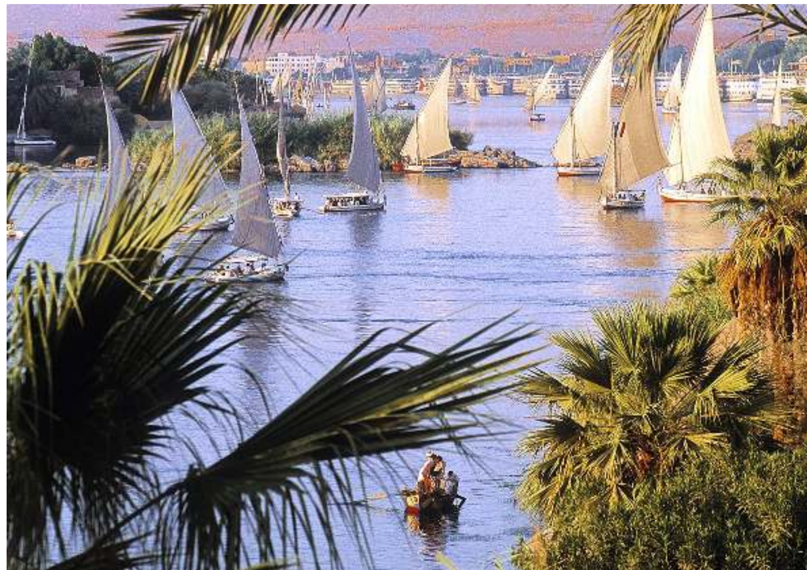
Nile River at Aswan

The Nile is Egypt's lifeline, the artery that runs through the entire country, from south to north. Only by being adrift on it can you appreciate its importance and beauty, and more practically only by boat can you see some archaeological sites as they were meant to be seen. Sailing is by far the slowest and most relaxing way to go, but even from the deck of a multistorey floating hotel you're likely to glimpse the magic.