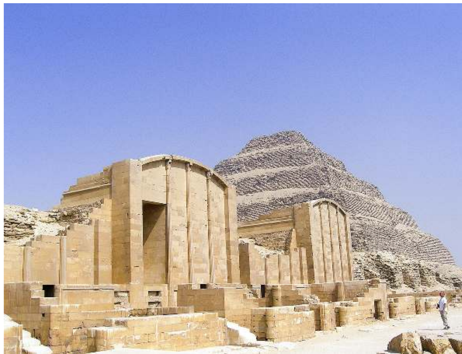
Step Pyramid of Zoser, Saqqara

The walls of the tombs around the Step Pyramid of Saqqara (adult/student E£50/25; 🕒 8am-4pm) are adorned with some of the world's oldest art works. The exquisite painted reliefs in the Mastaba of Ti or tombs of Akhethotep and Ptahhotep give a subtle and very detailed account of daily life in 2500BC. The first rooms in the Egyptian Museum show the most brilliant Old Kingdom art. Looking at these masterpieces is essential to understanding what comes in the thousands of years that follow.