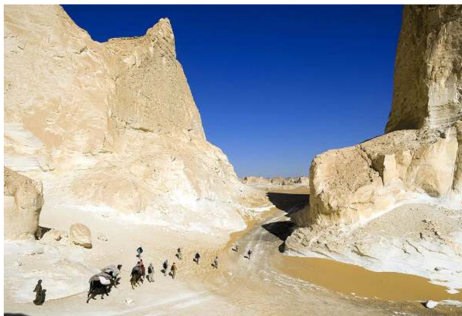
White Desert National Park

Whether you travel by 4WD, by camel or on foot, for a couple of hours or a couple of weeks, you'll be able to taste the simple beauty and sheer isolation of wildest Egypt. The highlights of an excursion in Egypt's Western Desert include camping under a star-studded sky among the surreal formations of the White Desert, crossing the mesmerising dunes of the Great Sand Sea, and heading deep into the desert to live out English Patient fantasies at the remote Gifl Kebir.